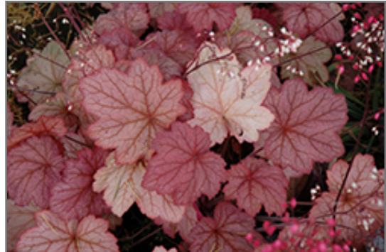
Georgia Peach Coral Bells foliage