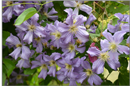
Prince Charles Clematis flowers