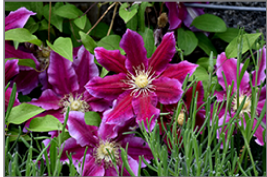
Hania Clematis flowers