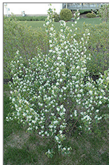
Pembina Saskatoon in bloom

This is a multi-stemmed deciduous shrub with an upright spreading habit of growth. Its relatively fine texture sets it apart from other landscape plants with less refined foliage. This plant will require occasional maintenance and upkeep, and is best pruned in late winter once the threat of extreme cold has passed. It is a good choice for attracting birds to your yard, but is not particularly attractive to deer who tend to leave it alone in favor of tastier treats. Gardeners should be aware of the following characteristic(s) that may warrant special consideration;