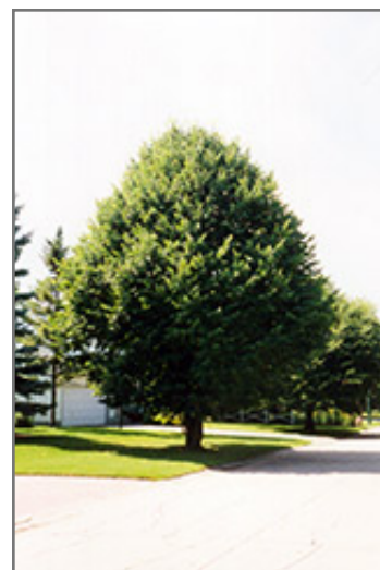
Littleleaf Linden