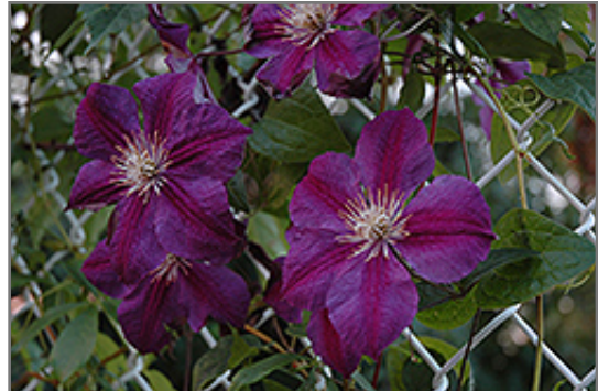
Star of India Clematis flowers