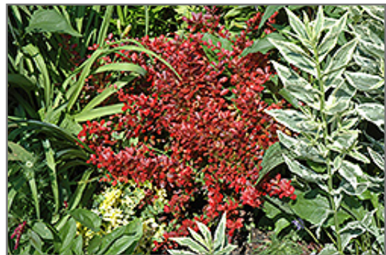
Cherry Bomb Japanese Barberry