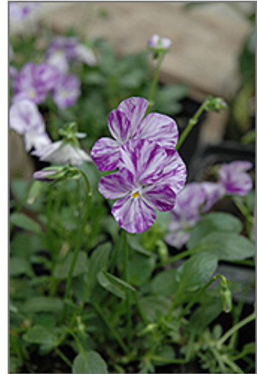
Rebecca Pansy flowers