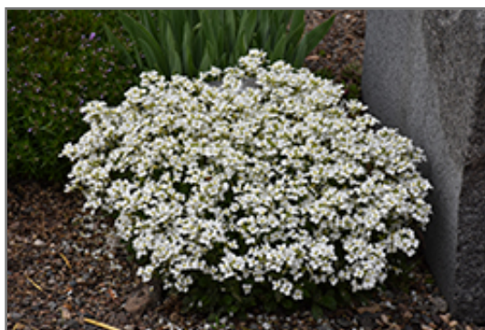
Little Treasure White Wall Cress in bloom

Little Treasure White Wall Cress is recommended for the following landscape applications;