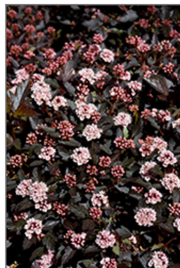
Little Joker Ninebark flowers

Little Joker Ninebark will grow to be about 24 inches tall at maturity, with a spread of 18 inches. It has a low canopy. It grows at a medium rate, and under ideal conditions can be expected to live for approximately 30 years.