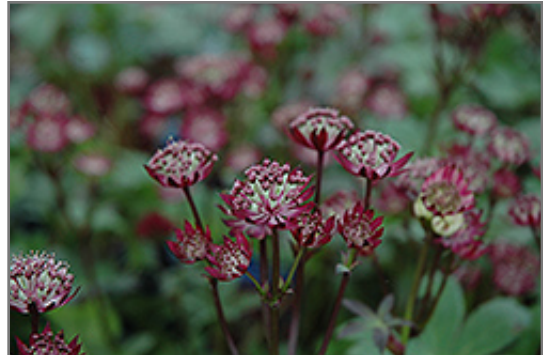
Ruby Wedding Masterwort flowers

Ruby Wedding Masterwort is recommended for the following landscape applications;