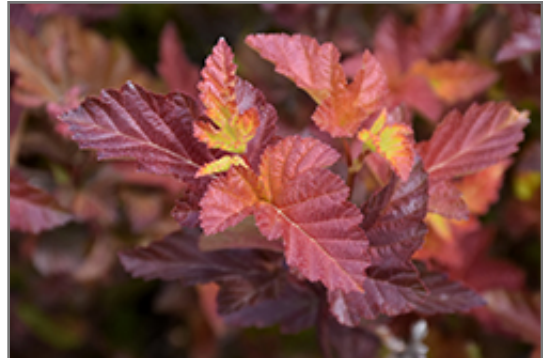
Center Glow Ninebark foliage