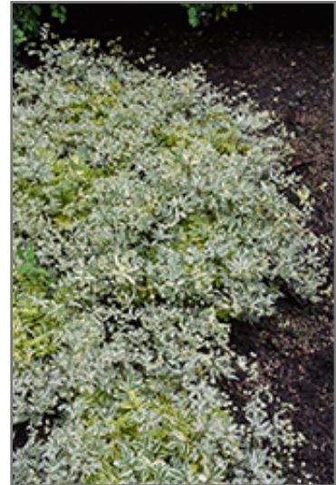
Golden Feathers Jacob's Ladder foliage