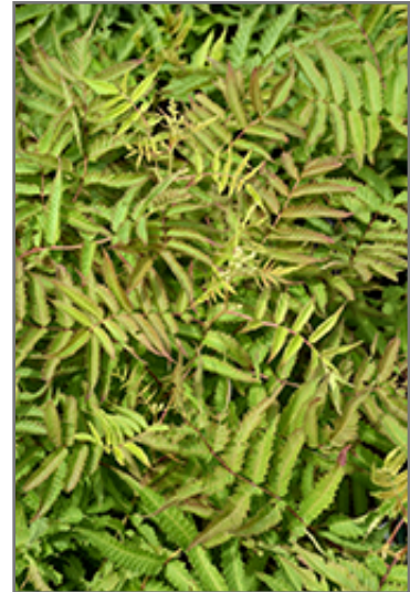
Matcha Ball False Spirea foliage