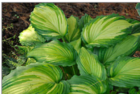
Angel Falls Hosta foliage

Angel Falls Hosta is recommended for the following landscape applications;