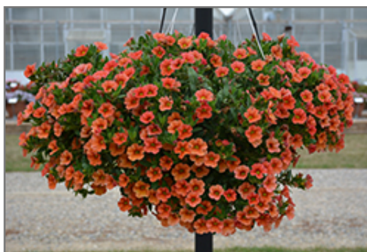
MiniFamous Uno Orange Calibrachoa in bloom