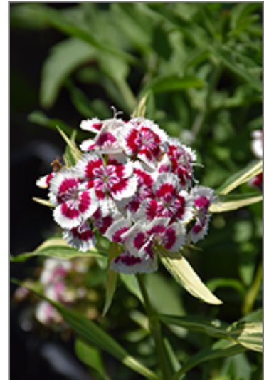
Barbarini Red Picotee Sweet William flowers

Barbarini Red Picotee Sweet William is recommended for the following landscape applications;