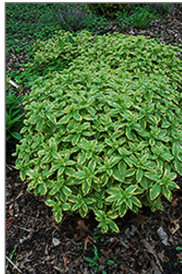
Golden Alexander Loosestrife