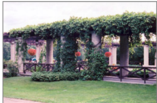
Virginia Creeper