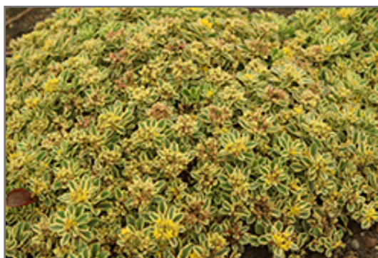
Rock 'N Low Boogie Woogie Stonecrop flowers

This is a relatively low maintenance plant, and is best cleaned up in early spring before it resumes active growth for the season. It is a good choice for attracting bees and butterflies to your yard, but is not particularly attractive to deer who tend to leave it alone in favor of tastier treats. It has no significant negative characteristics.