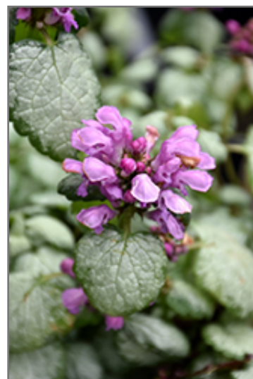
Red Nancy Spotted Dead Nettle flowers