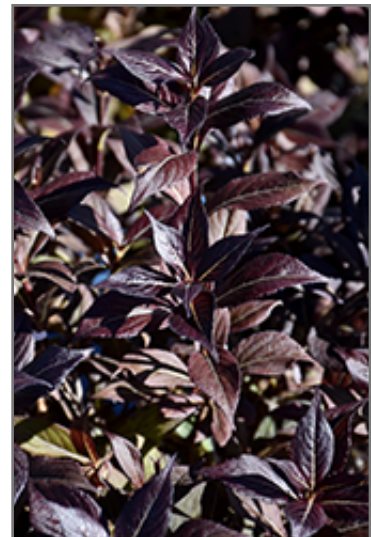
Date Night Stunner Weigela foliage