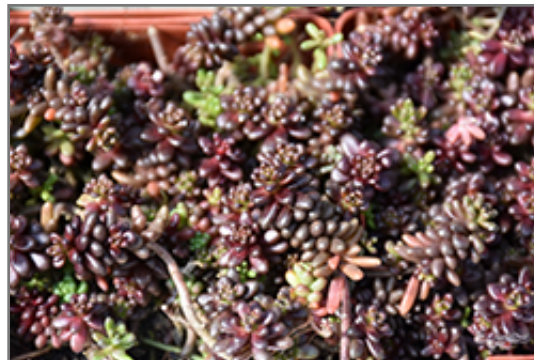
Twickel Purple Stonecrop foliage