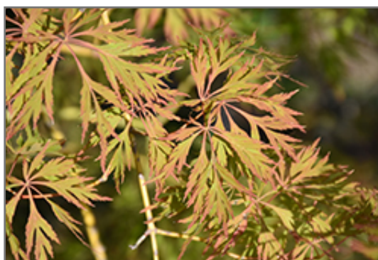
Ice Dragon Maple foliage