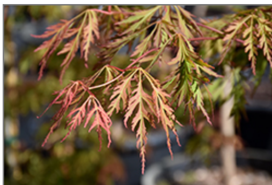
Ice Dragon Maple foliage

Ice Dragon Maple is ideal for use as a garden accent or patio feature, and is recommended for the following landscape applications;