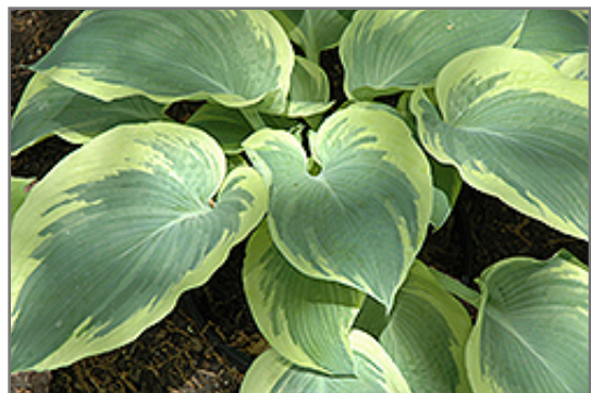
Northern Exposure Hosta foliage