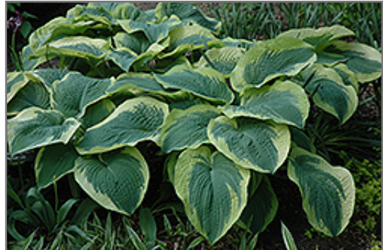
Northern Exposure Hosta

Northern Exposure Hosta is recommended for the following landscape applications;