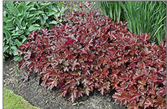
Chocolate Ruffles Coral Bells

Chocolate Ruffles Coral Bells is recommended for the following landscape applications;