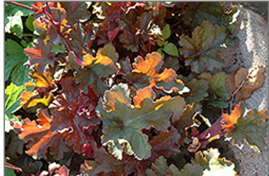
Chocolate Ruffles Coral Bells foliage

Chocolate Ruffles Coral Bells will grow to be about 10 inches tall at maturity extending to 24 inches tall with the flowers, with a spread of 12 inches. When grown in masses or used as a bedding plant, individual plants should be spaced approximately 10 inches apart. Its foliage tends to remain low and dense right to the ground. It grows at a medium rate, and under ideal conditions can be expected to live for approximately 10 years. As an evergreen perennial, this plant will typically keep its form and foliage year-round.