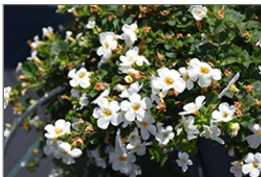
Snowstorm Snow Globe Bacopa flowers