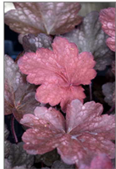
Carnival Candy Apple Coral Bells foliage