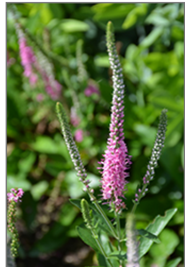
Perfectly Picasso Speedwell flowers