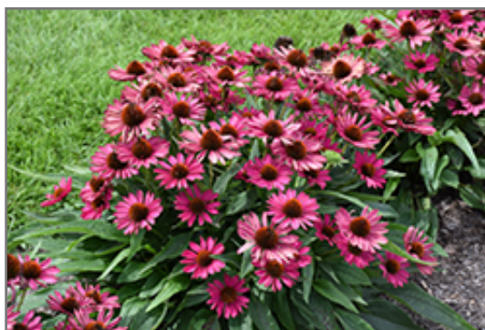
Kismet Raspberry Coneflower in bloom

Kismet Raspberry Coneflower will grow to be about 16 inches tall at maturity, with a spread of 24 inches. Its foliage tends to remain dense right to the ground, not requiring facer plants in front. It grows at a fast rate, and under ideal conditions can be expected to live for approximately 10 years. As an herbaceous perennial, this plant will usually die back to the crown each winter, and will regrow from the base each spring. Be careful not to disturb the crown in late winter when it may not be readily seen!