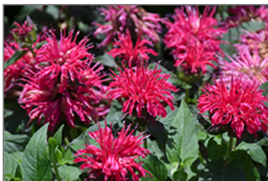
Balmy Rose Beebalm flowers

Balmy Rose Beebalm is recommended for the following landscape applications;