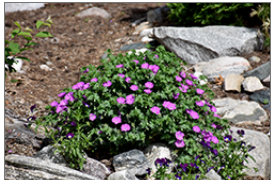
Bloody Cranesbill in bloom