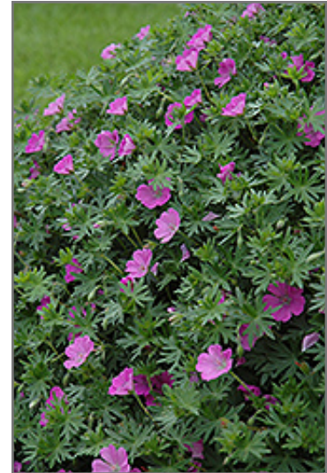
Bloody Cranesbill flowers

Bloody Cranesbill is recommended for the following landscape applications;