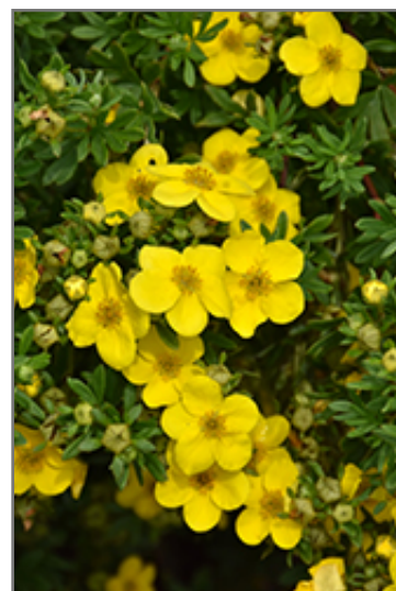
Happy Face Yellow Potentilla flowers