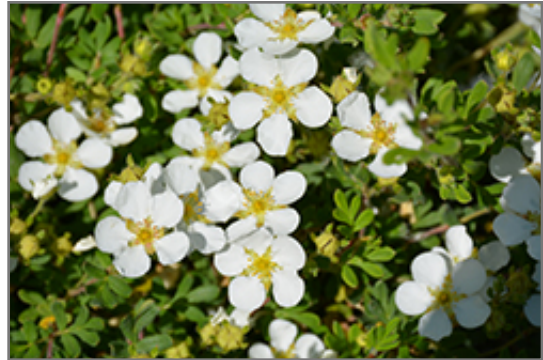
Happy Face White Potentilla flowers

Happy Face White Potentilla will grow to be about 3 feet tall at maturity, with a spread of 3 feet. It tends to fill out right to the ground and therefore doesn't necessarily require facer plants in front. It grows at a slow rate, and under ideal conditions can be expected to live for approximately 30 years.