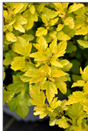
Tiny Wine Gold Ninebark foliage