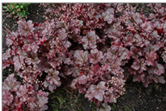
Berry Marmalade Coral Bells in bloom

Berry Marmalade Coral Bells is recommended for the following landscape applications;