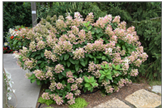
Little Quick Fire Hydrangea in bloom