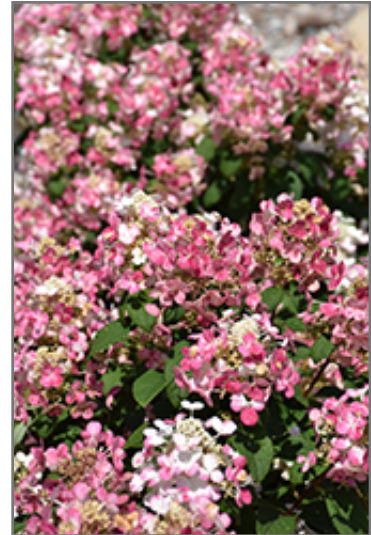
Little Quick Fire Hydrangea flowers