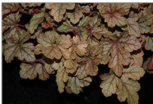
Honey Rose Foamy Bells foliage