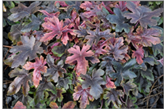
Brass Lantern Foamy Bells

Brass Lantern Foamy Bells is recommended for the following landscape applications;