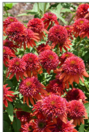
Double Scoop Orangeberry Coneflower flowers