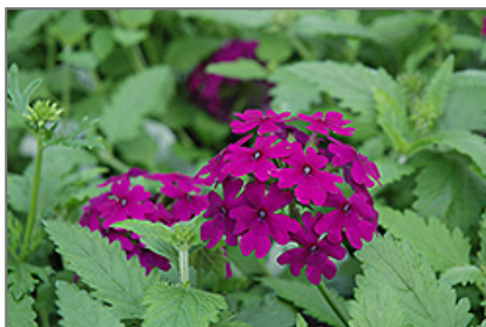
Superbena Purple Verbena flowers