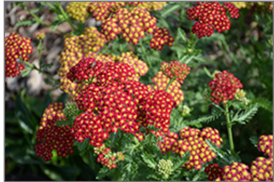
Terra Cotta Yarrow flowers

Terra Cotta Yarrow is recommended for the following landscape applications;