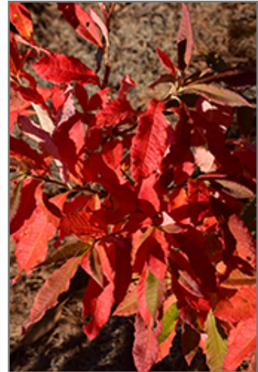
Rosy Lights Azalea in fall

This shrub does best in full sun to partial shade. You may want to keep it away from hot, dry locations that receive direct afternoon sun or which get reflected sunlight, such as against the south side of a white wall. It requires an evenly moist well-drained soil for optimal growth, but will die in standing water. It is very fussy about its soil conditions and must have rich, acidic soils to ensure success, and is subject to chlorosis (yellowing) of the foliage in alkaline soils. It is somewhat tolerant of urban pollution, and will benefit from being planted in a relatively sheltered location. Consider applying a thick mulch around the root zone in winter to protect it in exposed locations or colder microclimates. This particular variety is an interspecific hybrid.