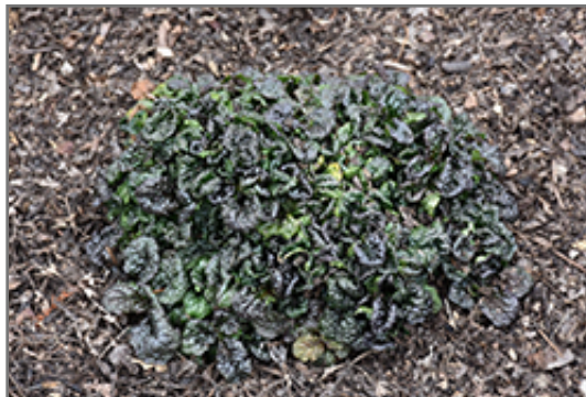
Mini Crisp Red Bugleweed