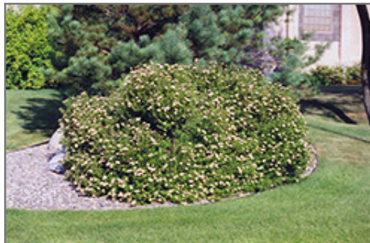
Pink Beauty Potentilla in bloom