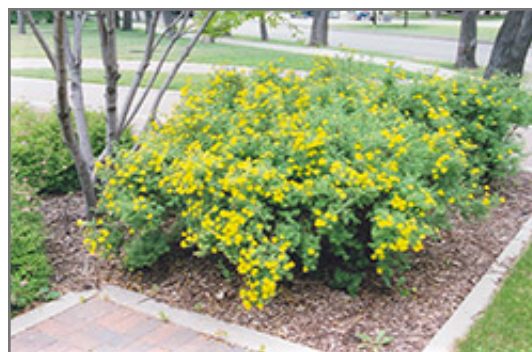
Coronation Triumph Potentilla in bloom