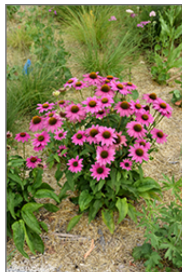
PowWow Wild Berry Coneflower in bloom

PowWow Wild Berry Coneflower is recommended for the following landscape applications;