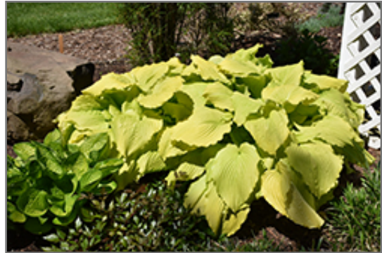
Dancing Queen Hosta

Dancing Queen Hosta is recommended for the following landscape applications;