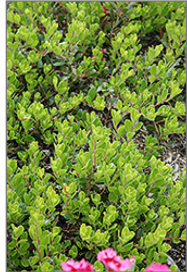
Bearberry foliage

This shrub does best in full sun to partial shade. It is very adaptable to both dry and moist growing conditions, but will not tolerate any standing water. It is considered to be drought-tolerant, and thus makes an ideal choice for a low-water garden or xeriscape application. It is very fussy about its soil conditions and must have sandy, acidic soils to ensure success, and is subject to chlorosis (yellowing) of the foliage in alkaline soils, and is able to handle environmental salt. It is somewhat tolerant of urban pollution. This species is native to parts of North America.