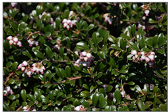
Bearberry flowers