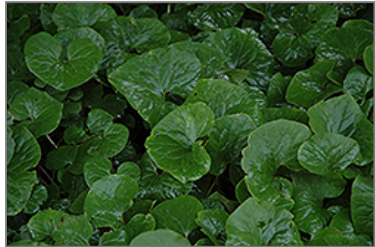
Canadian Wild Ginger